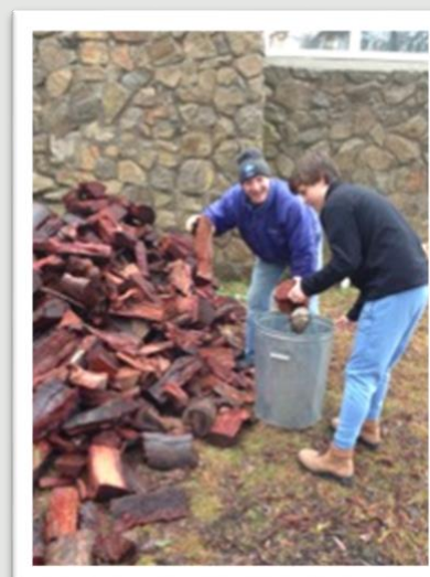
Work parties: All part of being in our great Club