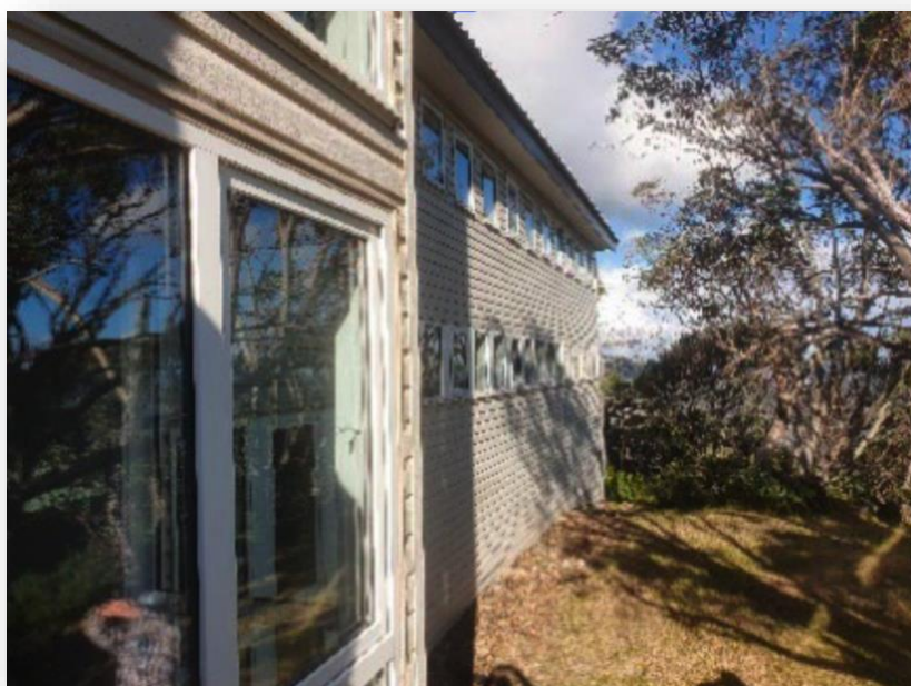
Breathmaker lodge accommodation wing, under which the "blasting" took place.

0900 start by some and a full crew by 1000. The main activity during the day was blasting. Very successful day and the last for the day was at 1830 leaving only nine to go.