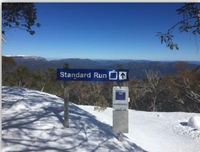
Ski-in/ski-out from Breathtaker Point outside the Buller Lodge in 2025