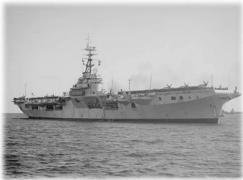
HMAS Sydney (III) circa 1951